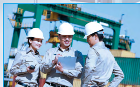
Port & Airport